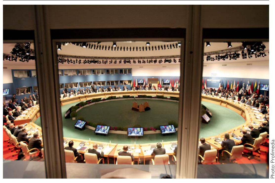
The founding summit of the Union for the Mediterranean

the transition to democracy in countries on the Mediterranean's southern shore gained momentum at the March 2011 Union for the Mediterranean Plenary Assembly in Rome. As stated by the official press release at the conclusion of that meeting: