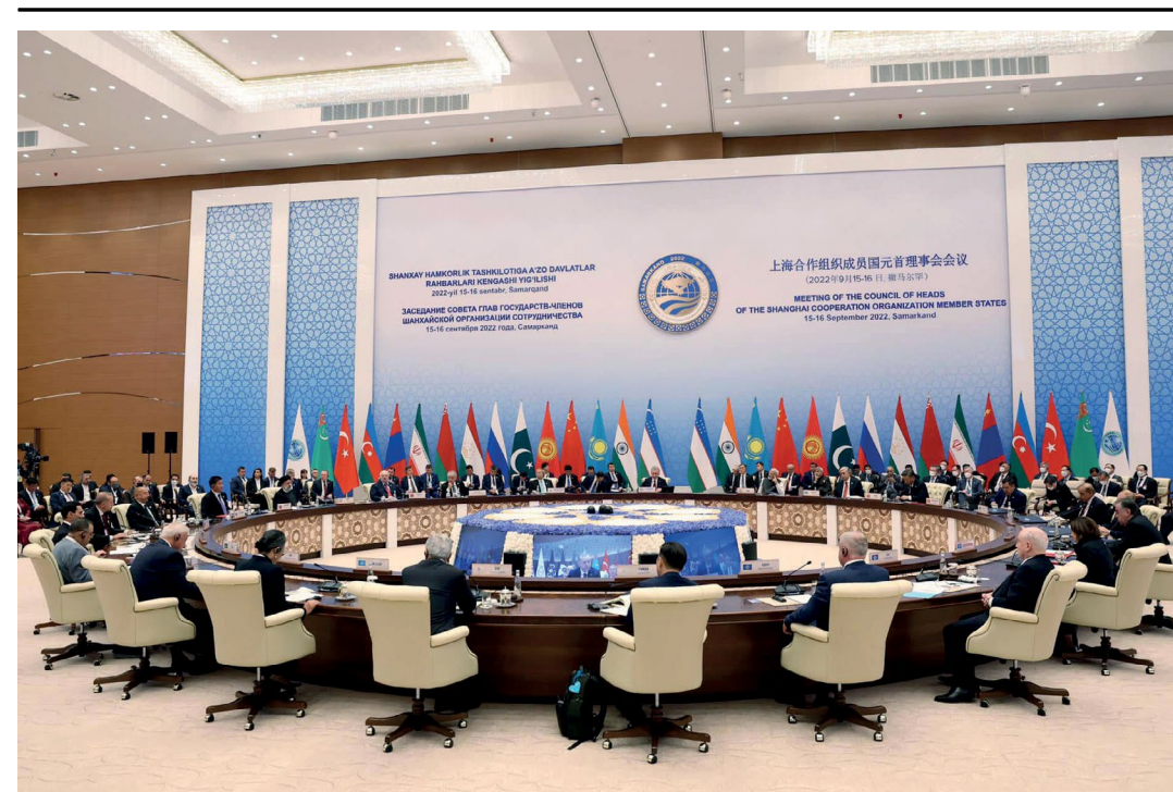
The 22 nd meeting of the Shanghai Cooperation Organization in session